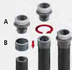
A Verschraubungsgehäuse connector body B Abdeckhülse cover sleeve